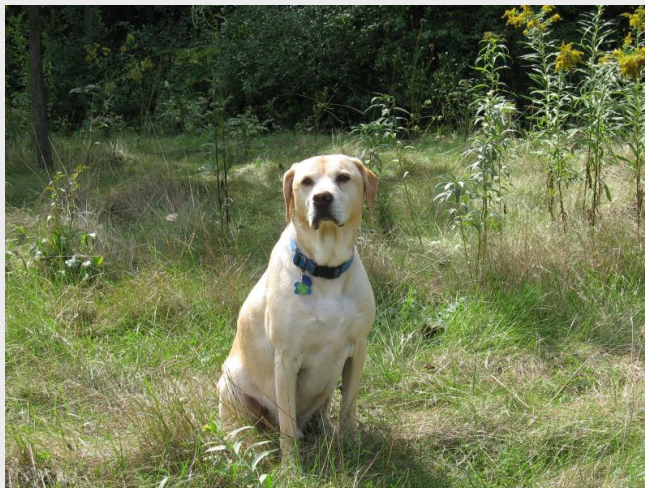
Meet Cody - Our Featured Pet for August 2015

Domestic cats might be determined hunters, but they stick mostly to residential areas instead of venturing into parks and protected areas where coyotes roam. That's the key finding from a North Carolina State University analysis of more than 2,100 sites — the first large-scale study of free-ranging cats in the U.S. published in the Journal of Mammalogy. Read More